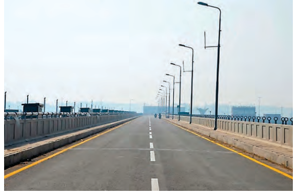
> Figure A7: New road connectivity. The 1.34-kilometer bridge across the New Khanki Barrage connects the opposite riverbanks.