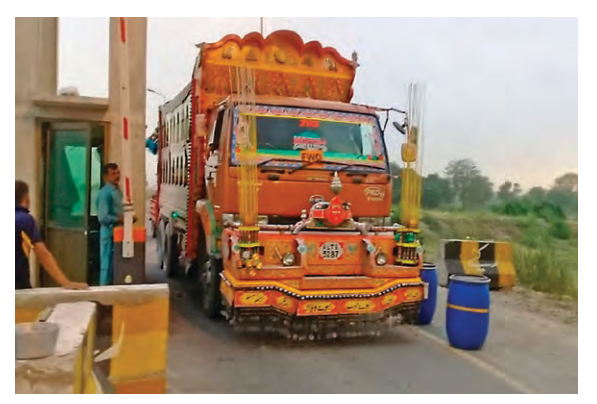
> Figure A10: Road user fee. The toll plaza on the New Khanki Barrage.