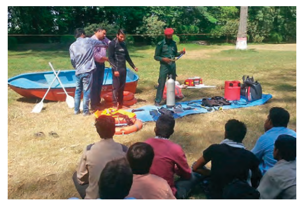
> Figure A16: Empowering the community. Flood mitigation and first-aid training for the community.