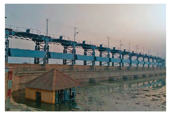
Figure A1: The Old Khanki Headworks. One of the oldest headworks in Pakistan, completed in 1892 and dismantled in 2016.