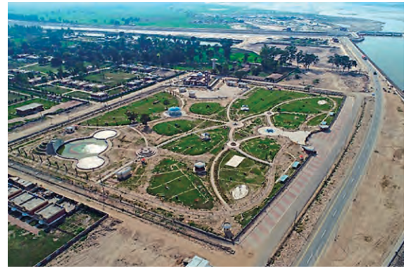
> Figure A11: Bird's eye view of the recreation park. Located on the left bank with the barrage visible in the background.