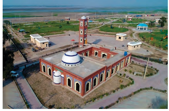
> Figure A15: Masjid (mosque). Located at the corner of the recreation park).