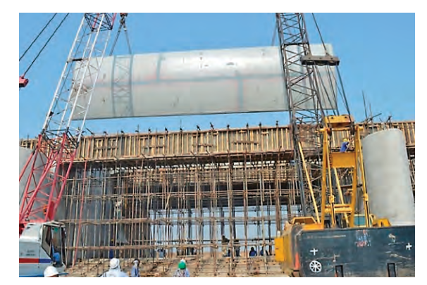
> Figure A4: Gate installation. Gate being installed in one of the bays.

> Figure A3: Barrage bays under construction. The New Khanki Barrage has 65 bays.