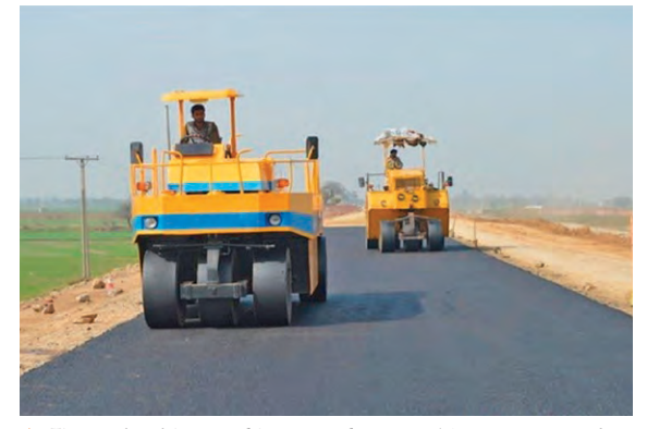
> Figure A9: New and improved access. New access roads in the areas surrounding the New Khanki Barrage.

> Figure A8: Supervisory control and data acquisition system. The view from the control room, with the barrage in the background.