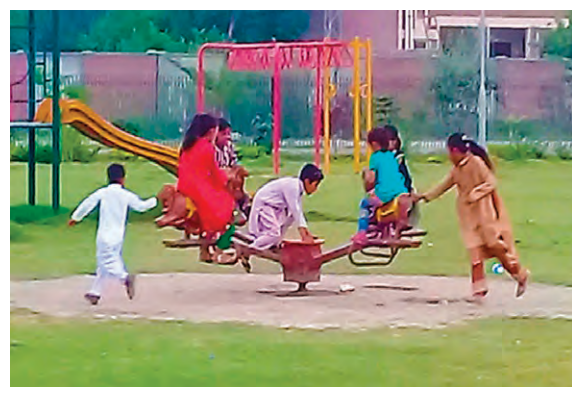
> Figure A14: Recreational park. Children in play areas reserved for families.