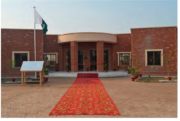
> Figure A12: Khanki girls' high school. Entrance to the new building located in Khanki Village.