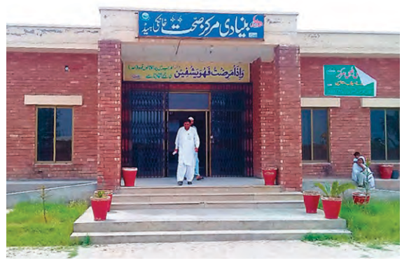
> Figure A13: Basic health unit. Located next to the recreation park.